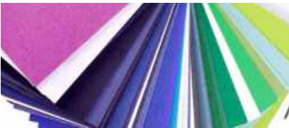
Paper & Packaging [a,c,d]