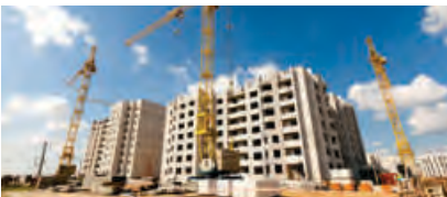
Building & Construction [a,c,e]