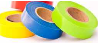
Adhesive & Sealants [a,c,f]