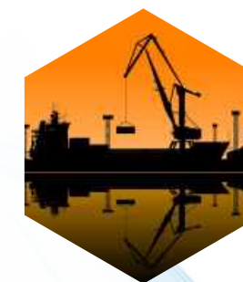
INFRASTRUCTURE & LOGISTICS