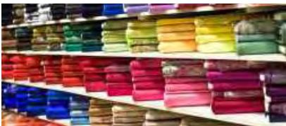
Textile Industries [a,c,d]