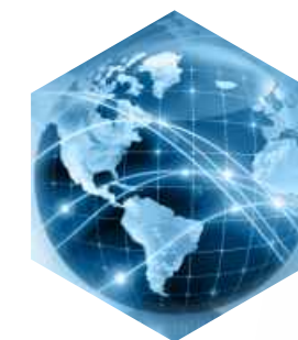
TRADE, DISTRIBUTION & MANUFACTURING

Our core business domains, listed below, complement each other, enabling us to offer holistic solutions.