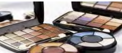
Personal Care [a,b,c,d]