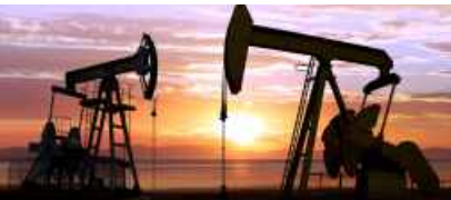
Oil & Gas Chemicals [a,b,c,e,f,g]