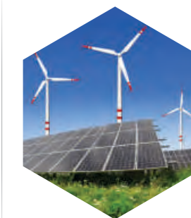
ALTERNATIVE FUEL & ENERGY