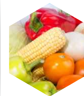
AGRO VENTURES & BIOTECHNOLOGY