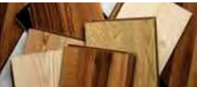
Laminates & Plywoods [a,c,d]