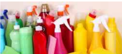
Surfactants & Detergents [a,c,d]