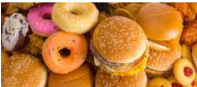
Food & Beverages [a,d,e,g]