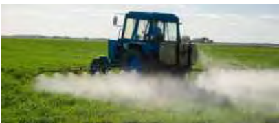
Agro Chemicals [a,c,d,h]