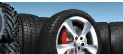
Tyre & Rubber [a,c,e,f]