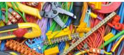
Electronics & Electricals [a,b,c]

Note: [a,b,c] denotes co-relation of Business Verticals and Industry Verticals